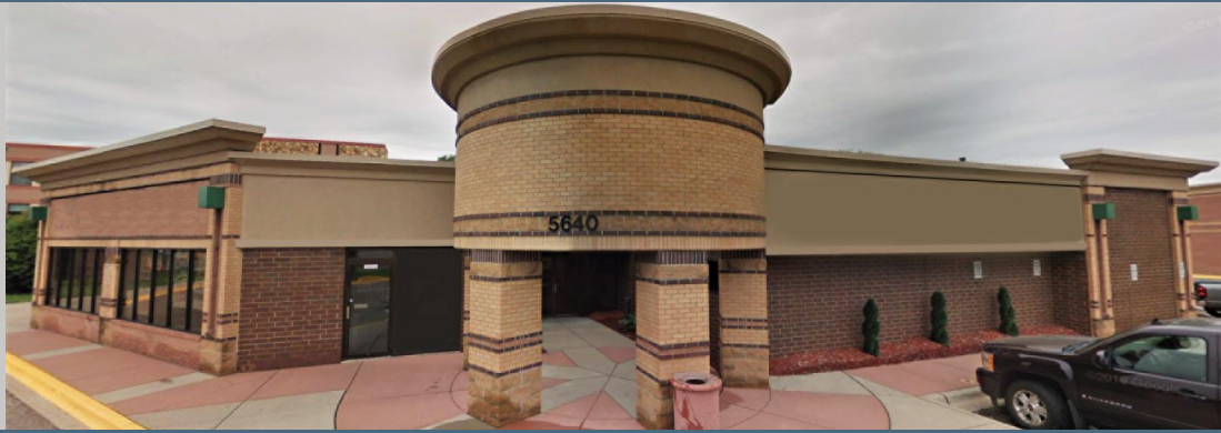
NEW LOCATION IN CRYSTAL TOWN CENTER

CRYSTAL TOWN CENTER | 5640 W BROADWAY AVE, CRYSTAL, MN 55428